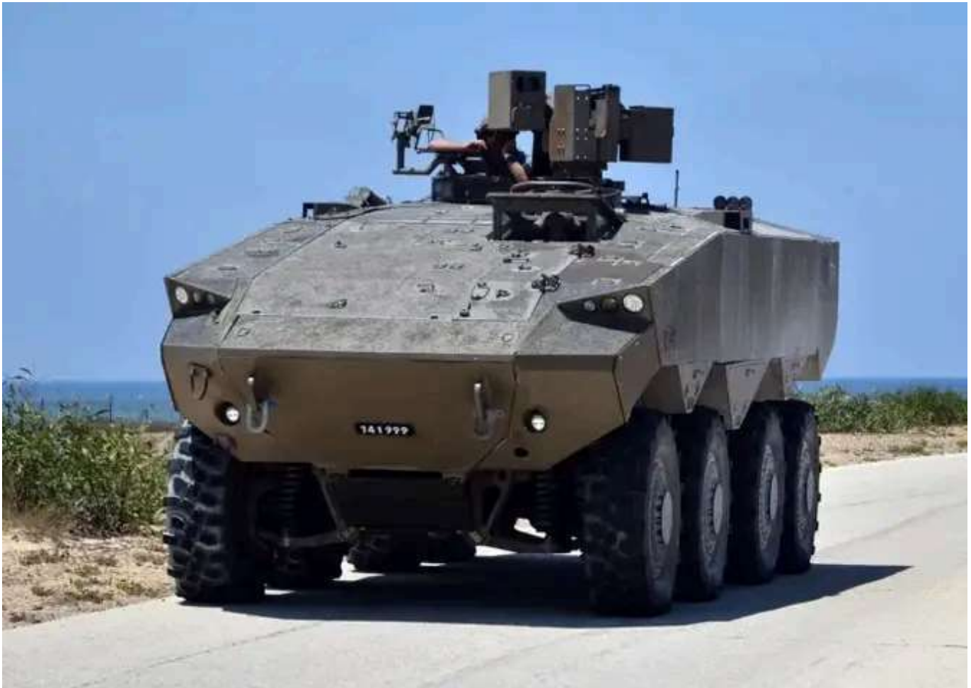
Israel Defense Forces Eitan 8×8 Armoured Fighting Vehicles.