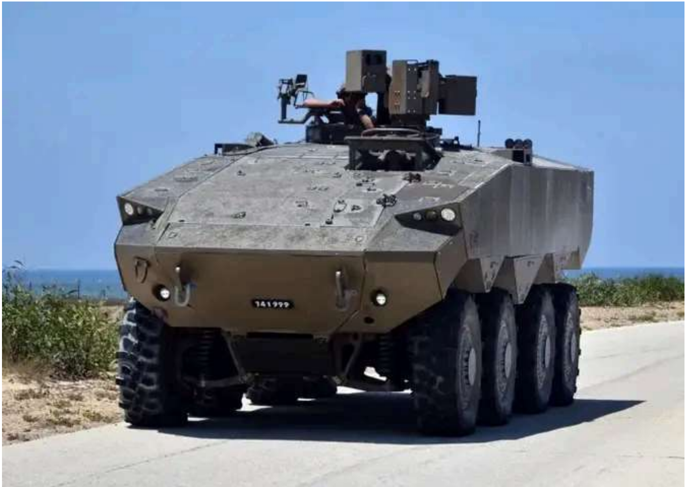
Israel Defense Forces Eitan 8×8 Armoured Fighting Vehicles.